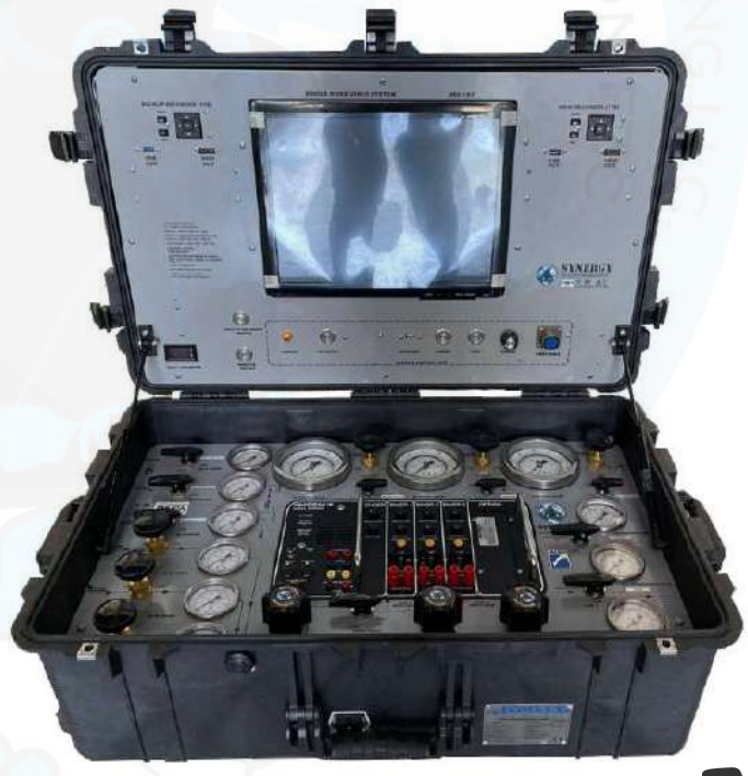
PART NO : SY-3DAP-D040-R-1DV Three diver panel with radio and diver 1 cctv