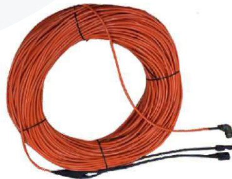
PART NO : SY-VC-150M