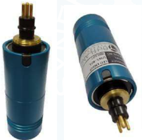
PART NO : SY-UWL-401