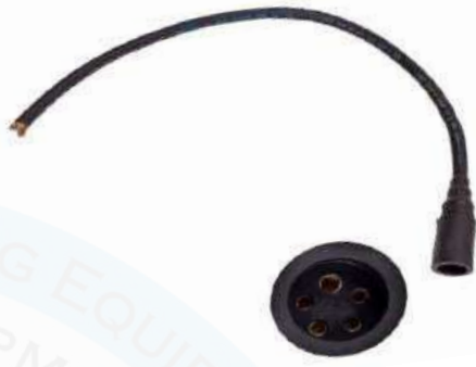
PART NO : SY-RMK-5-FS