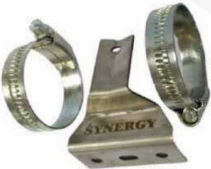
PART NO : SY-CLBRK