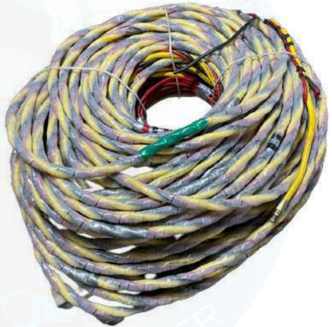
Diving Umbilical with spiral wrap