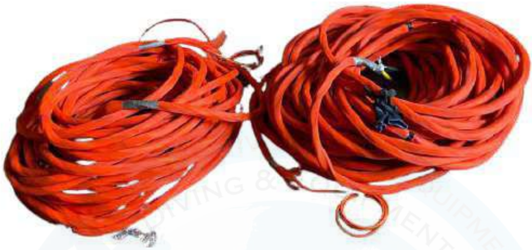
Diving Umbilical with protective outer sheet