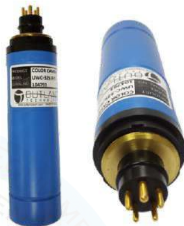
PART NO : SY-UWC-325/p/e