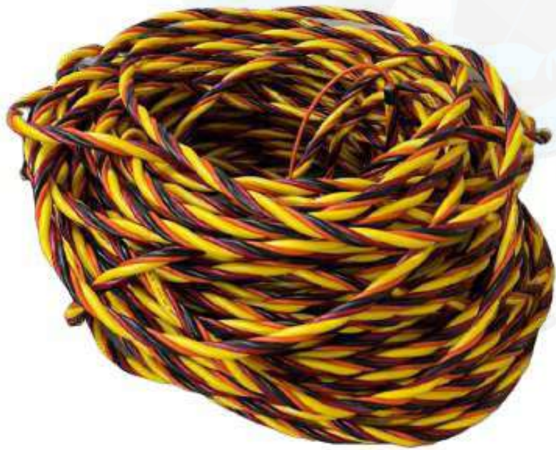
Diving Umbilical without protective outer sheet