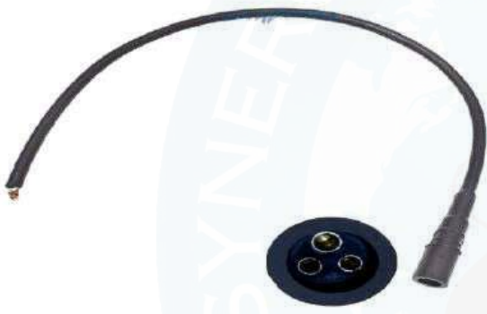
PART NO : SY-RMG-3-FS